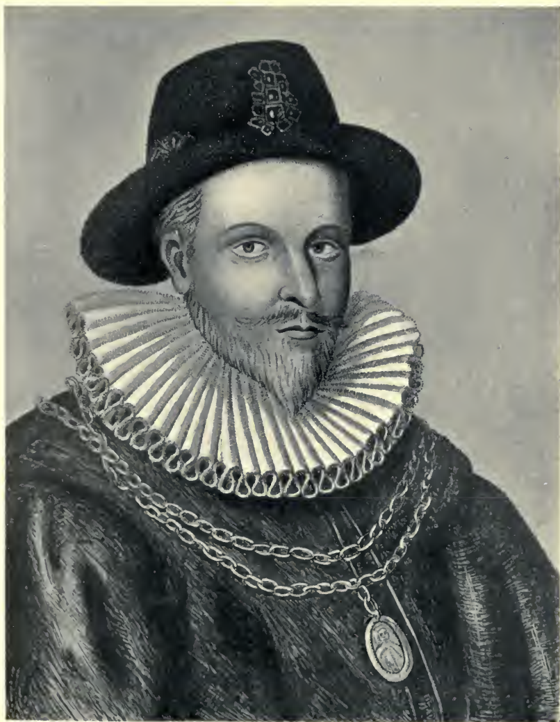
GEORGE KEITH Fifth Earl Marischal